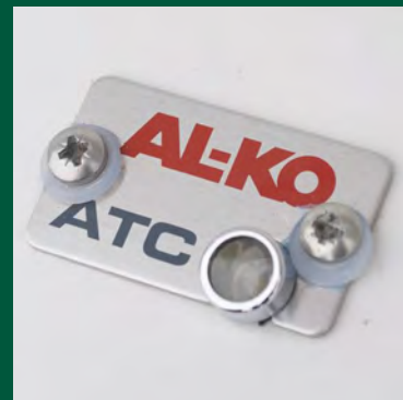
Alko Trailer Control