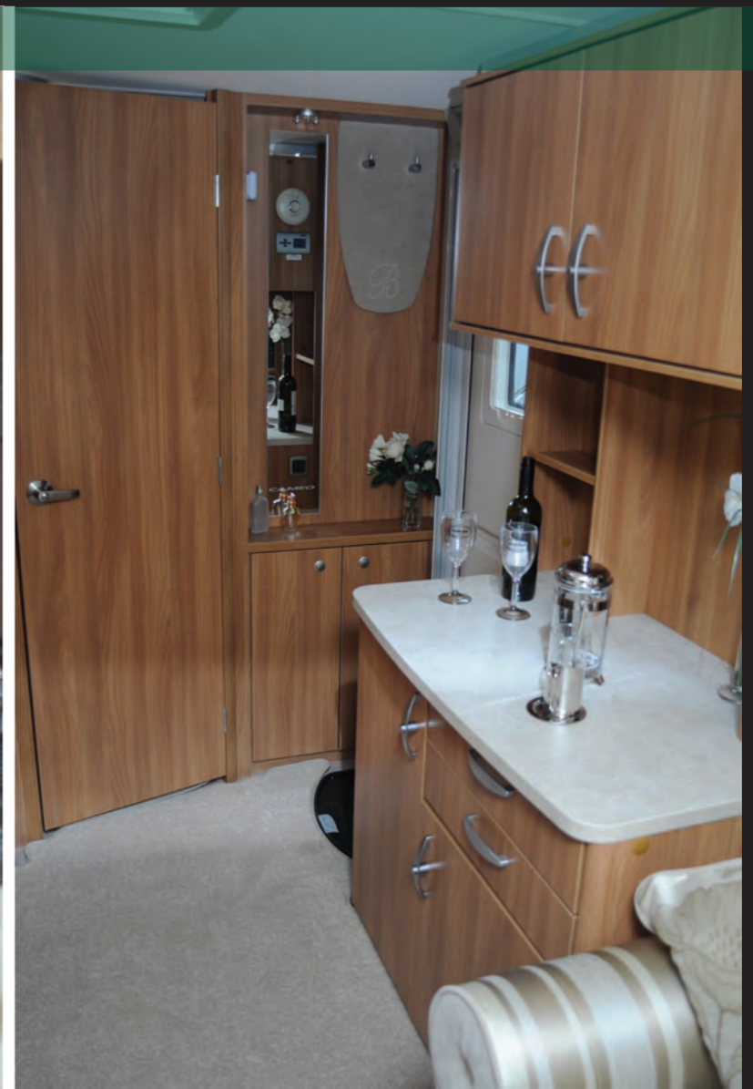
1 Remote Heki 4 Rooflight –moisture sensitive 2 Front Binnacle 3 Alde Central Heating 4 Omnivent to Kitchen Area