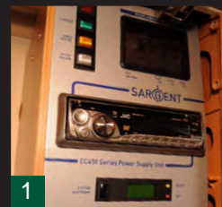
1. Sargent Power Supply 2. Twin Satellite Points 3. Control Panel