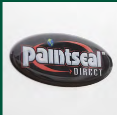
Paintseal treatment to exterior