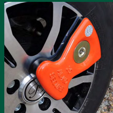
Alko Secure Wheel Lock