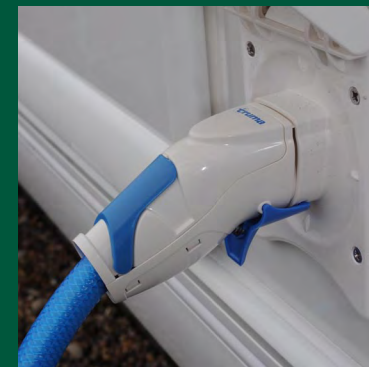
Ultraflow water line